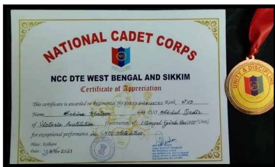
Certificate of appreciation